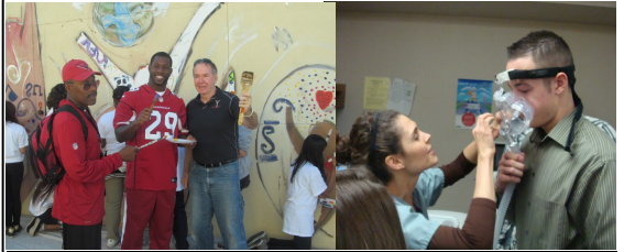
Arizona Cardinals participate in a mural project at Balsz Elementary and Coronado High School Students explore healthcare careers at Scottsdale Healthcare.

Valley of the Sun United Way and Jobs for Arizona's Graduates are committed to preparing youth to succeed in middle school, high school and on the path to graduation.